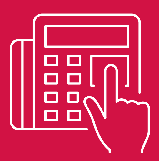
Access Control Systems